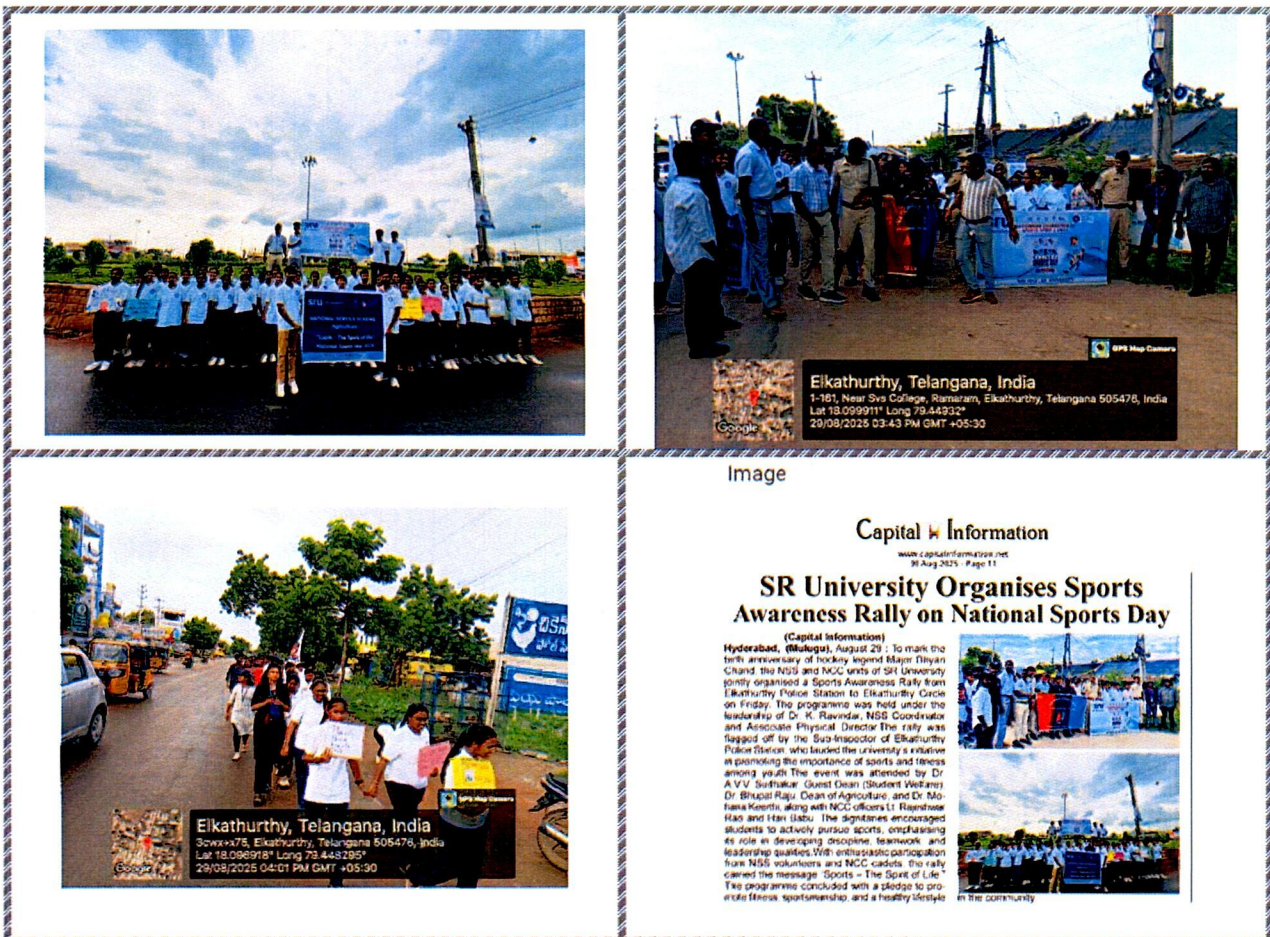
Caption: “Sports Awareness Today, Healthy India Tomorrow”